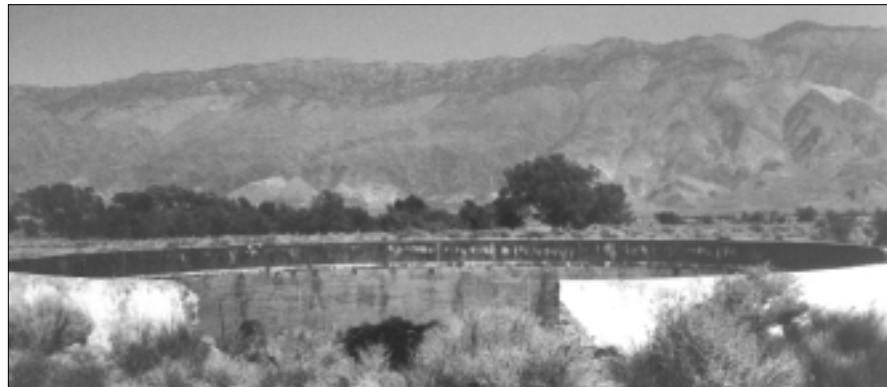
Manzanar clarifier, circa 1976.