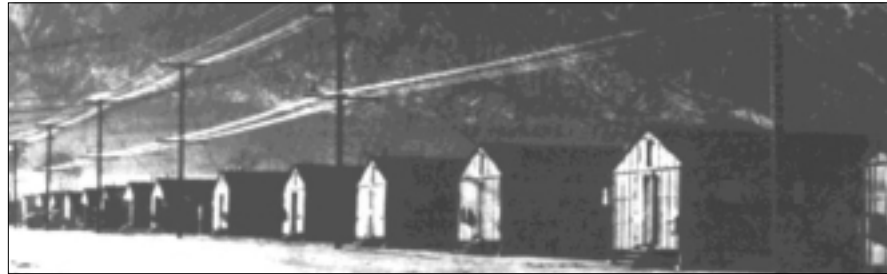
Barracks at Manzanar; circa 1943.

Disinfection was accomplished through two 200-pound-per-day chlorine