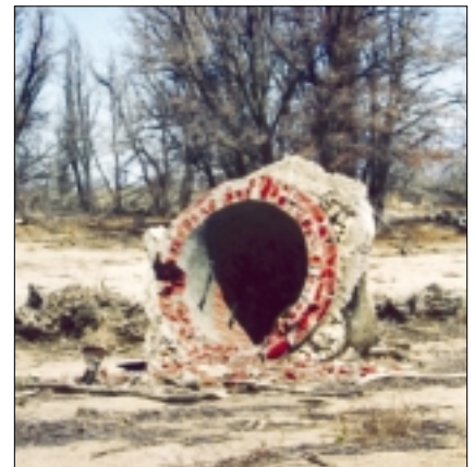
Collection system manhole.

Manzanar's arid location made the task of providing clear, clean potable water difficult. A reservoir impounding area was built diverting the majority of the camp's