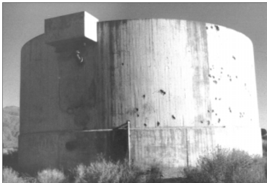
Manzanar digester, circa 1976.