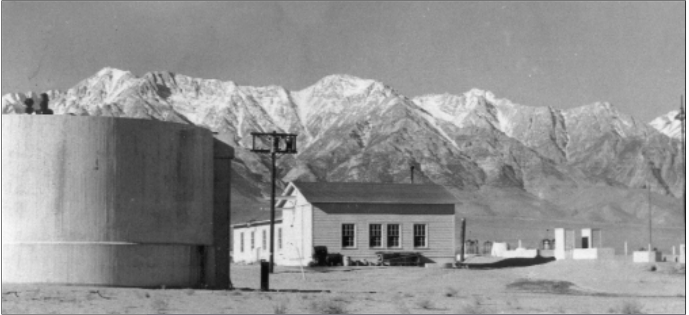
Manzanar wastewater facility, circa 1944.