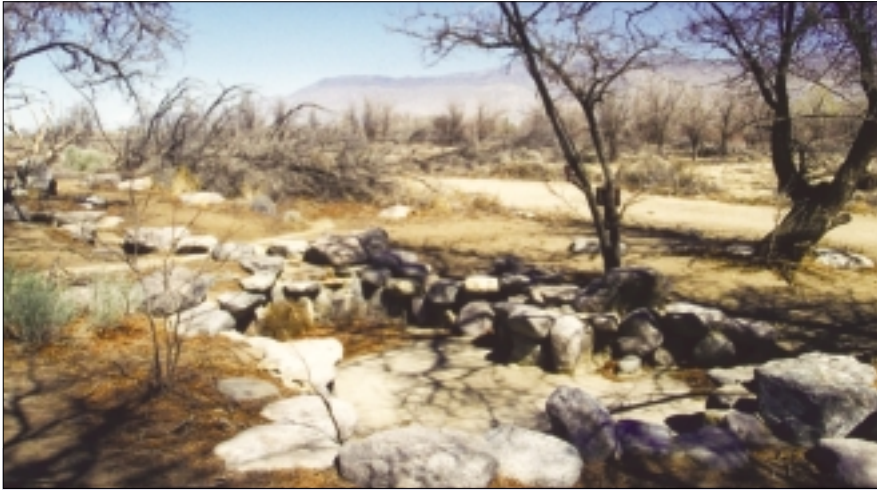
Restored water garden.

The systematic gathering of persons of Japanese ancestry and forcibly moving these people to relocation facilities (often referred to as concentration camps) was an enormous task. Japanese-American families were given little warn-