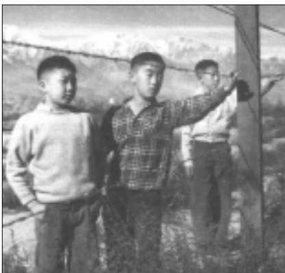
Life outside the barbed wire at Manzanar.

Editor's Note: In remembrance of the recent 50th anniversary of the bombing of Pearl Harbor, this article looks at the state-of-the-art facilities of the Manzanar War Relocation Center used for the relocation of Japanese American citizens and aliens.