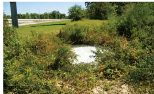
The acoustic-based leak detection assessment pinpointed a massive leak on a span of pipe that was located in a remote area, close to a road embankment.

The use of acoustic-based leak detection and