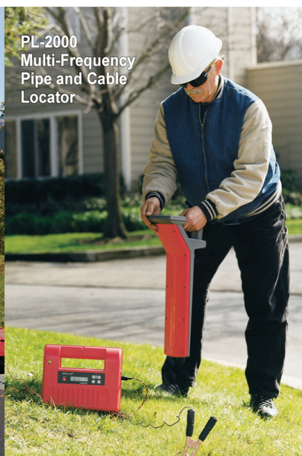
PL-2000 Multi-Frequency Pipe and Cable Locator