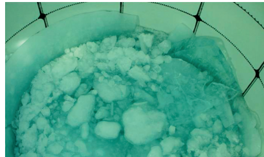
Figure 6a: Interior view of the unmixed tank at Old Town, Maine. Each bolted panel is 4x10 feet. The ice load on the walls of this tank is estimated to be roughly 100,000 lbs.