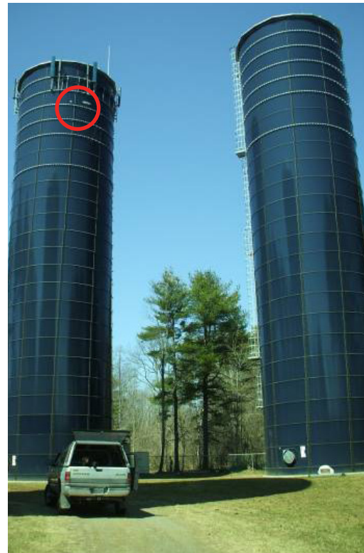
Figure 5: Old Town, Maine purchased two glass-lined storage tanks but within the first two years, they saw damage to the glass lining of the tank (red circle).

» The tank without a mixer accumulated a large collar of ice, estimated to weigh over 100,000 pounds (Figure 6a). But the tank with the mixer remained ice-free (Figure 6b).”