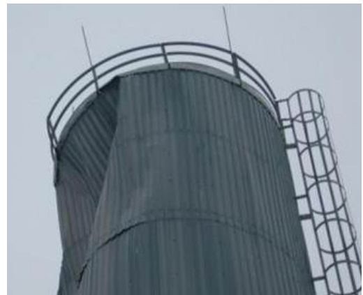
Figure 4: Ice can block tank vents, preventing air from entering while the tank is draining. This can cause low pressure inside the tank and can, as in this case, crush the tank.