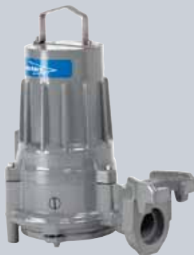
Flygt M 3068.170