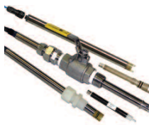
S80 / S10 / S17

The Model 2122 Cooling Tower Control System (CTCS) from ECD is an integrated system designed to control the acid feed, blow down and inhibitor/biocide feed to a Cooling Tower.