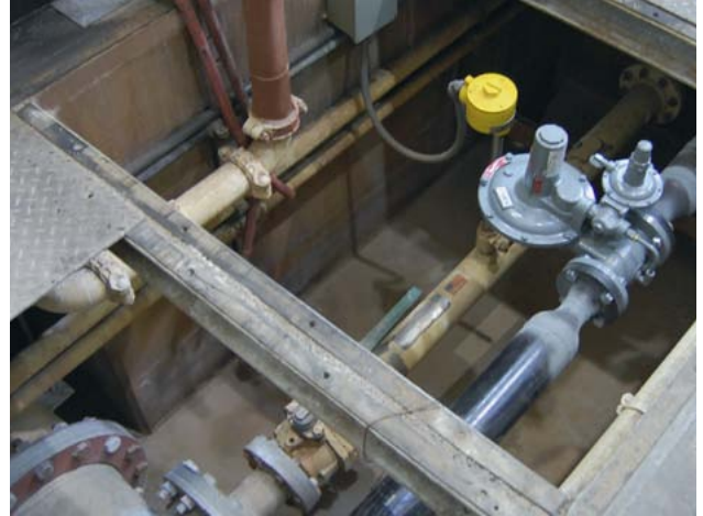
Figure 1: WWT Plant Underground Vault With FCI ST98 flow meter

In most plants, each of several aeration basins is configured with numerous diffuser systems, and individual air flow monitoring with independent control is generally required for each diffuser system. The compressor system