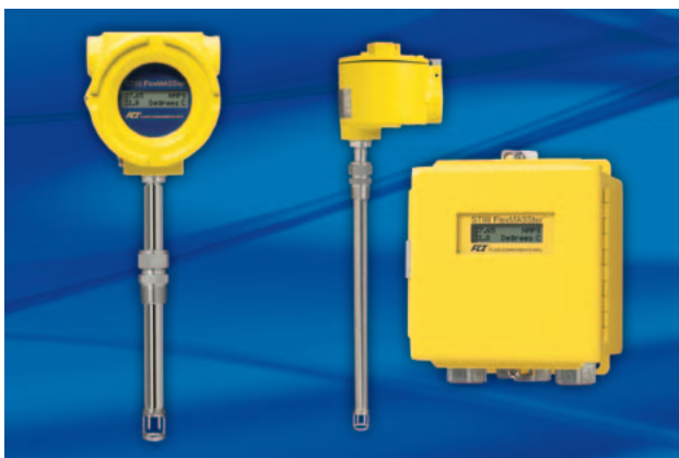
Figure 2: ST98 Flow Meter With Remote Configuration Transmitter

Stephen Cox, Sr Member Technical Staff, Fluid Components International