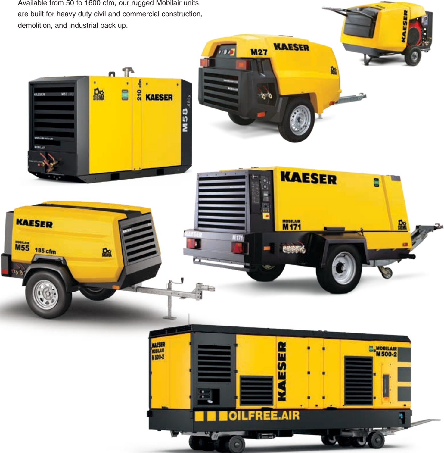
M500-2 portable oil-free delivers 1600 cfm.

Available from 50 to 1600 cfm, our rugged Mobilair units are built for heavy duty civil and commercial construction, demolition, and industrial back up.