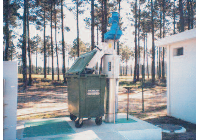
Outdoor-installation with frost-protection