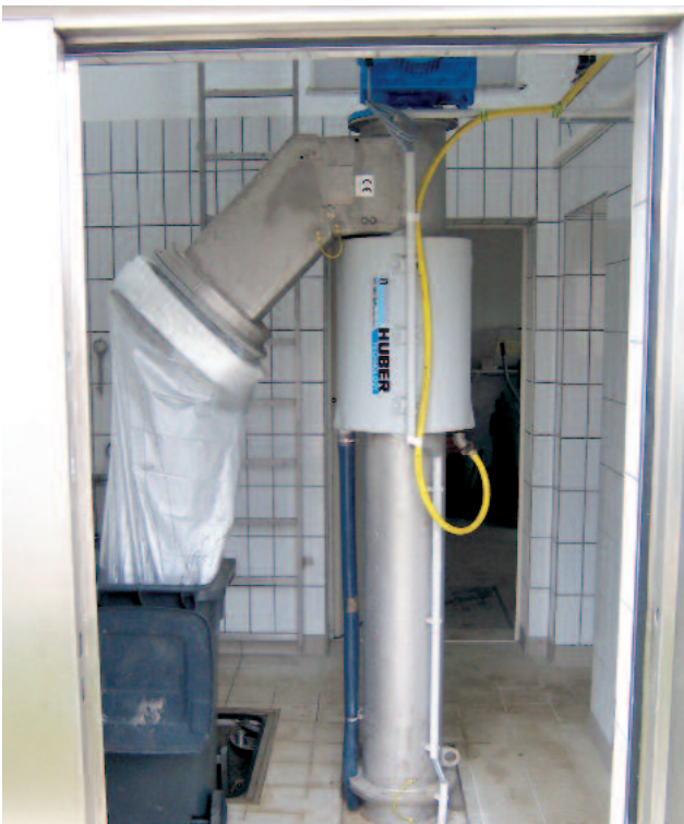
Screenings discharge into a bagger