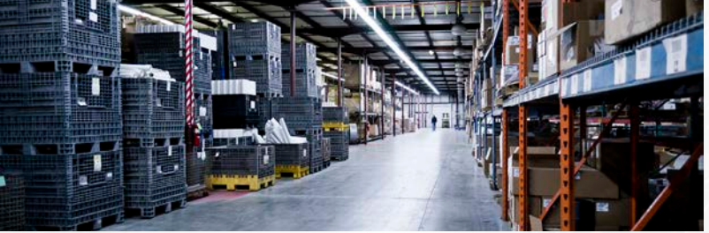
Diffuser Express™ Warehouse Inventory

Diffuser Express® is your single-source resource for all your membrane diffuser replacement or upgrade needs. All products provided by Diffuser Express™ can be considered “brand neutral” and used to replace most major brands currently on the market. Having EDI’s inventory to choose from means you can rely on Diffuser Express™ to provide you with the parts you need on a quick turn-around basis. EDI provides competitive prices since pricing is always a consideration!