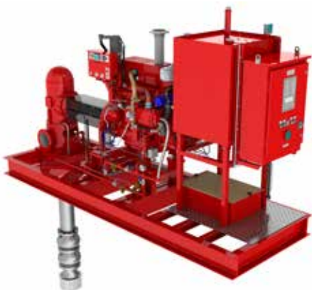
Typical Pump for an Offshore Rig

Every pump is subjected to a thorough inspection and a series of tests to ensure that it meets the required specifications before leaving the factory.