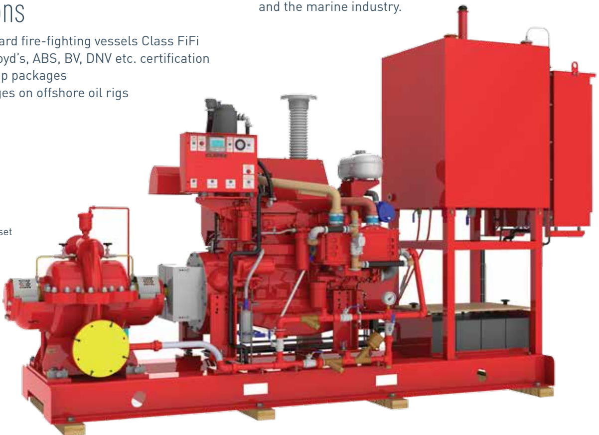
Diesel driven pump set