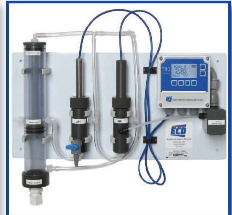
Model HP80 Hydrogen Peroxide Analyzer