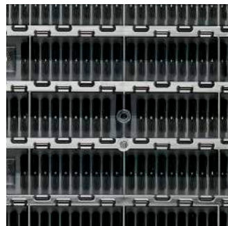
I.M.S 200 media retainer