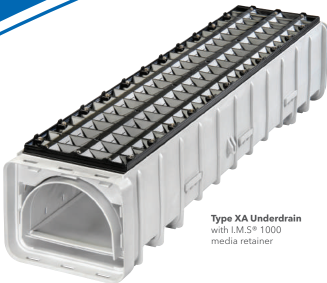
Type XA Underdrain with I.M.S.® 1000 media retainer