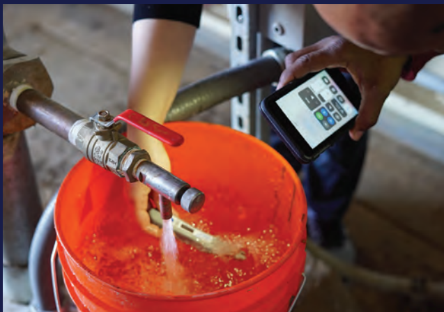
Sensors provide real-time conditions