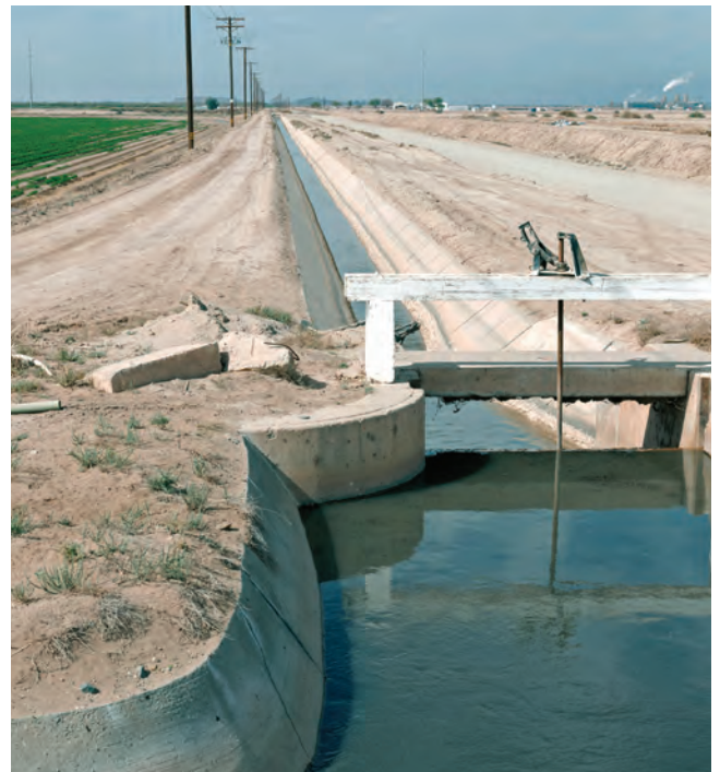
Remote monitoring and control for irrigation

The XiO User Interface turns your data into actionable insights. Real-time alarms via SMS text and email enable operators to respond quickly to emerging issues. Multiple areas of a process or operation may be integrated to provide system-wide visibility, so that operators can manage proactively.