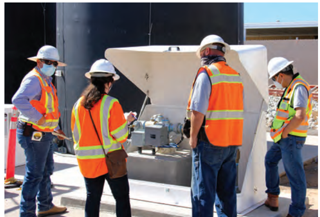
Drinking water treatment

Safety Roadside Rest Areas — Systems meet the specific needs of regional rest areas, including drinking water treatment, disinfection, and wastewater collection and treatment.