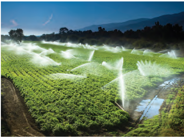
Multiple agricultural applications

Farms, Vineyards, and Ranches — Systems are designed for various agricultural needs, including specialty hydroponic crops, groundwater pumping reporting, irrigation, and water storage.